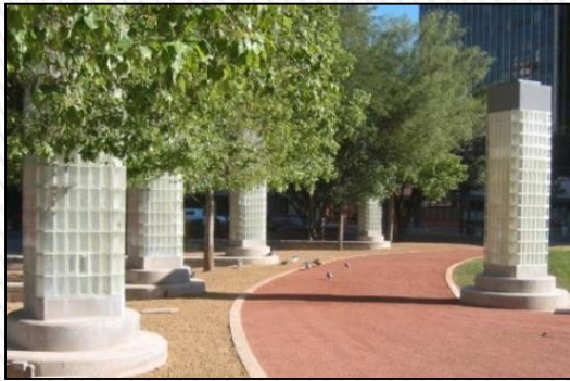
Central Library Plaza Renovation Tucson, AZ*