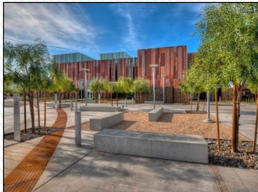
South Mountain Community College Library, Phoenix, AZ*