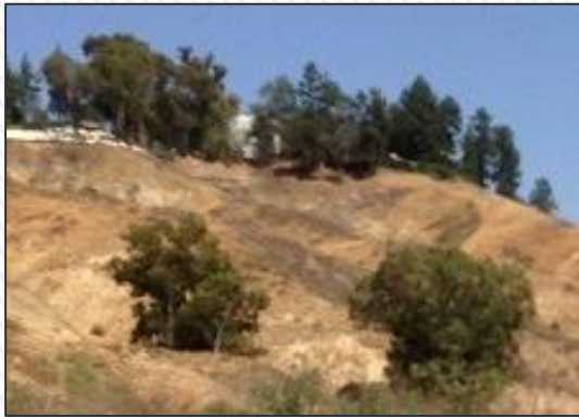
Redlands Open Space Maintenance & Management Plan, Redlands, CA