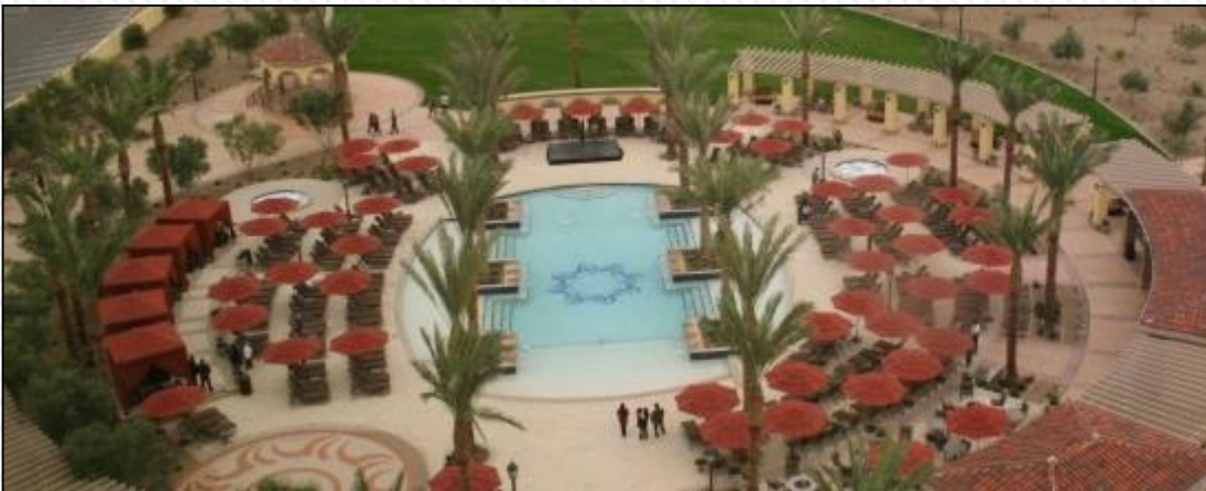
Casino del Sol Resort & Spa, Enterprise of the Pascua Yaqui Tribe, AZ*