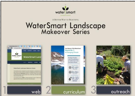
San Diego County Water Authority WaterSmart Community Workshops, San Diego CA