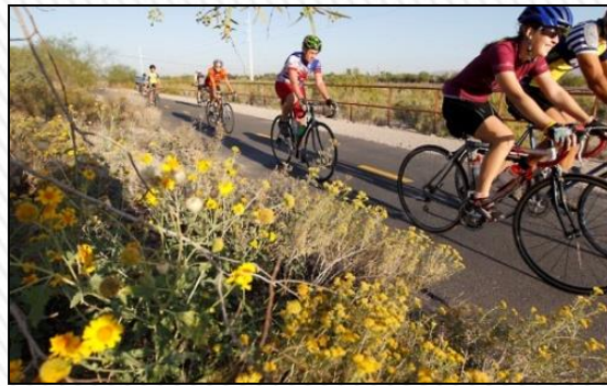
Pima County Landscape QCL, Greenway Trails Network Pima County, AZ