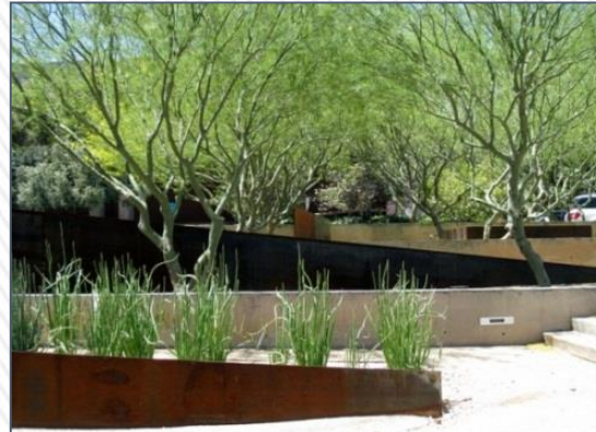
Meinel Optical Science Facility University of Arizona*